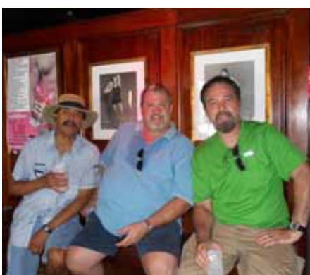
Enjoying a Sunday afternoon @ Lafitte's