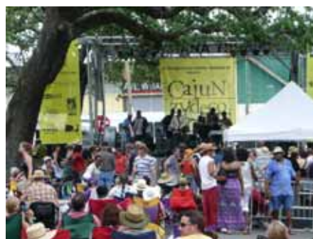
Louisiana Cajun Zydeco Festival @ the US Mint