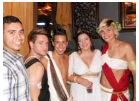
A cute bunch @ Jules' Toga Party