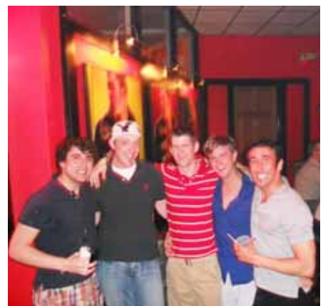
Hanging out @ Sound Factory