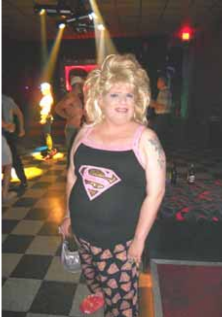
Alright for that Sound Factory Pajama Party!