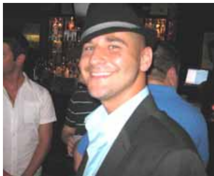
Hot body ...look out!!!