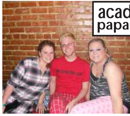
Having a blast @ Sound Factory PJ Party