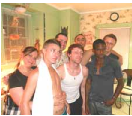
What a great after-party at Rick's house