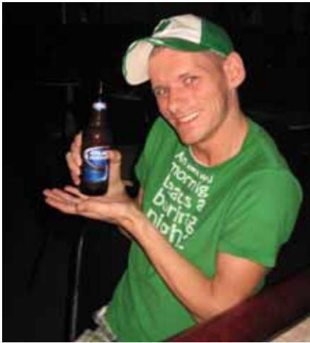
Beer ...it does a body good