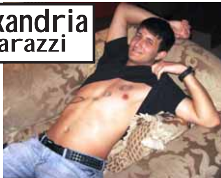
Sexy security guard