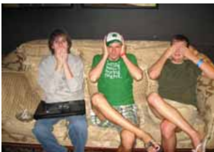
Hear no drag queens, see no drag queens, speak of no drag queens