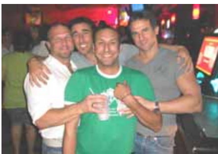
Cutting up @ Sound Factory