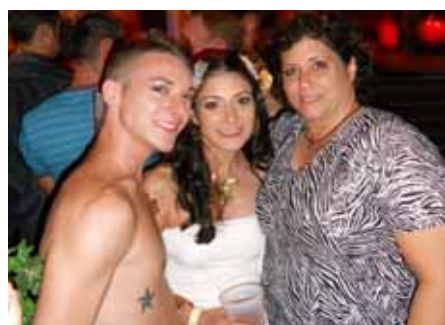
What a beautiful mix @ Jules' Toga Party