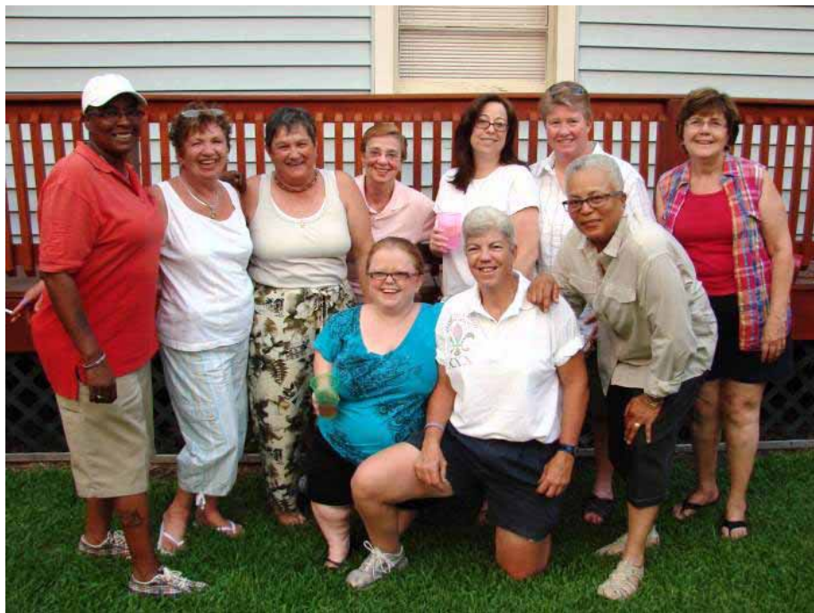
Apollo's Women's Auxiliary Members

issue of Ambush is devoted to these old and new members with a few friends invited to come along for the celebration. Not all the pictures were used, but I'll try to get to them in a later issue. There is an annual and elegant meeting of the former royalty members, but this is a private club gathering that welcomes the new royalty each year. It is an honor to be a part of this - and one that sets the standard for all future royalty members.