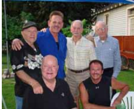
Group of Apollo royalty members