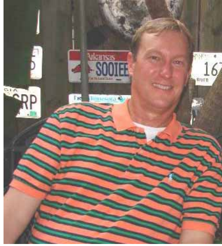
Former king Jimmy