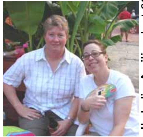
Berry & Red