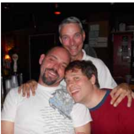
The cats of Murder at the Howard Johnson's @ Always Lounge