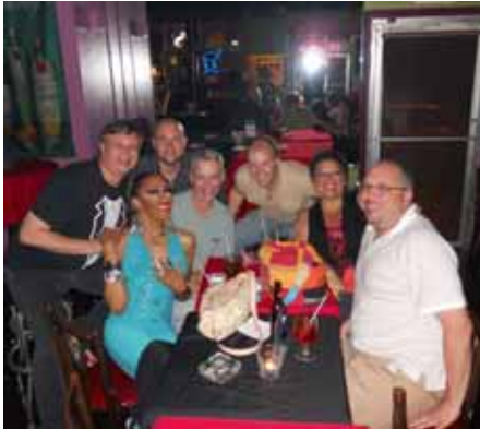
Partying after the FourPlay show @ JohnPaul's