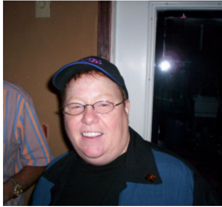
Top 5 Lesbian of the Year Finalist Red Velour from Phoenix