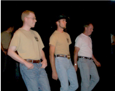
The men of Cowpokes represent Top 5 Show Bar of the Year Finalist Cowpokes