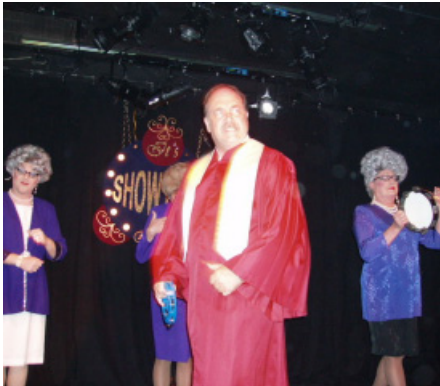
Special Guests, the Austin Baptist Women