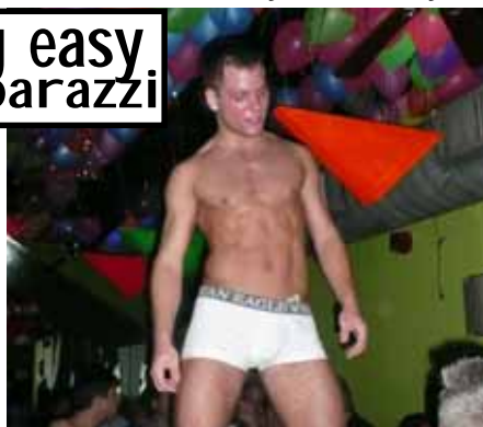
One of the Men of Oz @ Oz's 18th Anniversary 18th Anniversary Neon Party