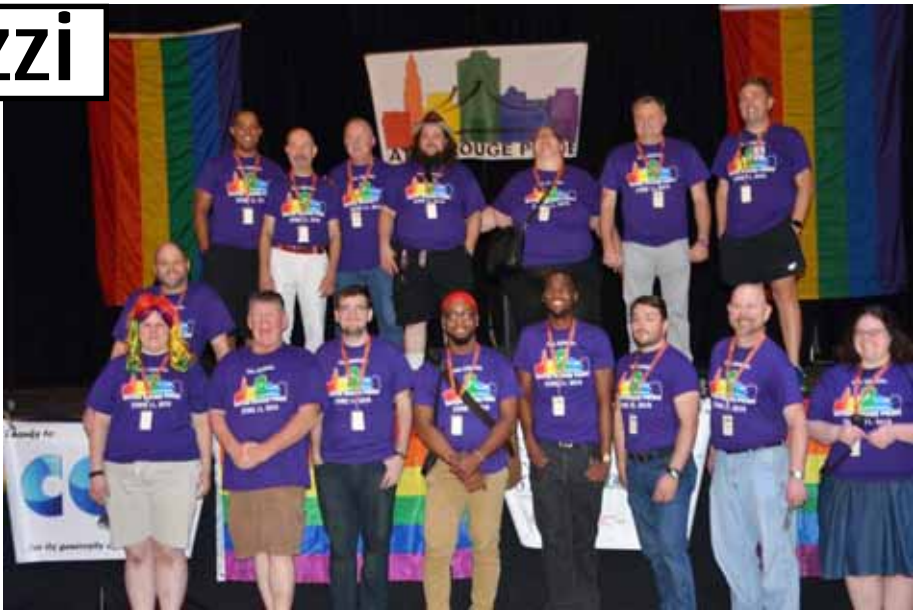
Baton Rouge Pride celebrated its 10th anniversary as the largest Pride celebration in Louisiana recognized by Louisiana Governor John Bel Edwards making June LGBT Pride Month, and by Baton Rouge Mayor Kip Holden naming June 11 as Baton Rouge Pride/LGBT Pride Day.