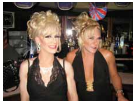
Sisters or mother & daughter