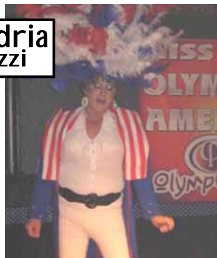
A Patriotic Chica