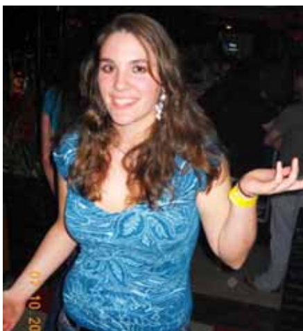
Yes...??? Can I help you?