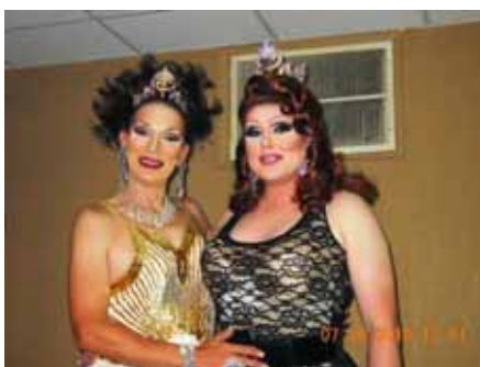
Olympus Bar's title holders