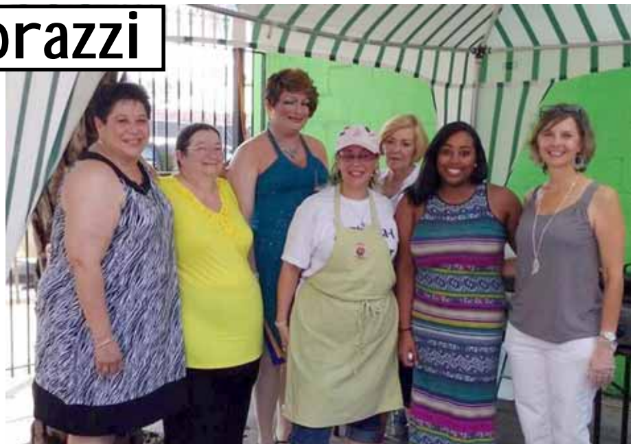
The Looney Birds Team celebrates at The Color Party hosted by Tulane Ave. Bar in New Orleans which raised $493 for Mary Bird Perkins Cancer Center. Look for Tulane Ave Bar on www.Facebook.com .