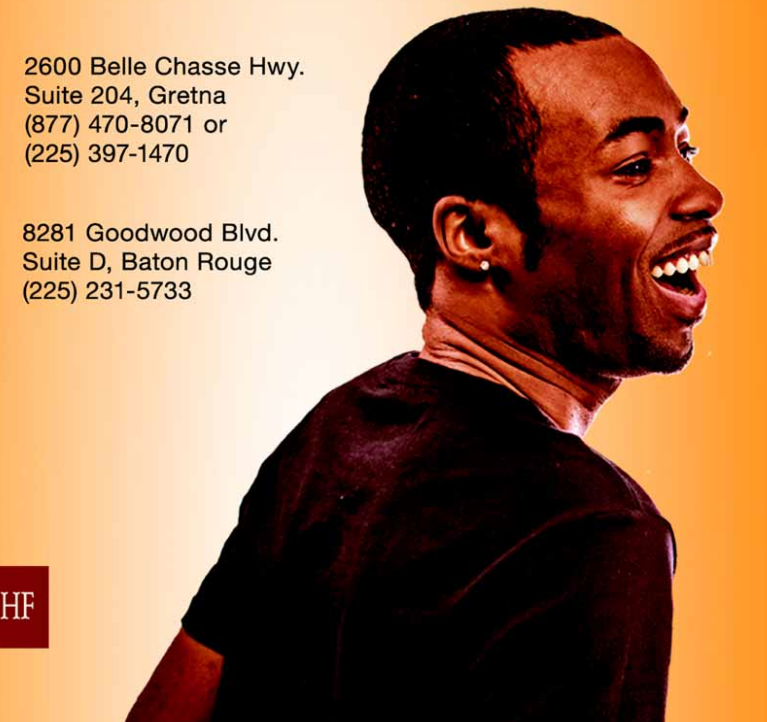
GayNewOrleans.com • NOLAPride.org • July 19-August 1, 2016 • Facebook.com/AmbushMag • The Official Mag©: AmbushMag.com • 5