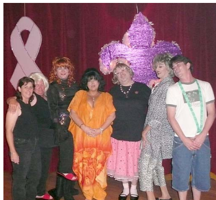
The stars of the Crescent City Outlaws' Sock Hop show