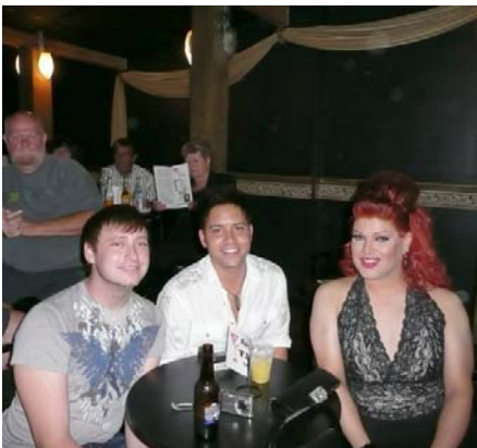
Splash Baton Rouge's 2nd VIP Table