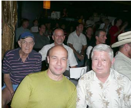
C&B (Chuck & Bill) Enterprises' VIP Table