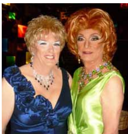
Deja Deja-Vue' & Opal Masters