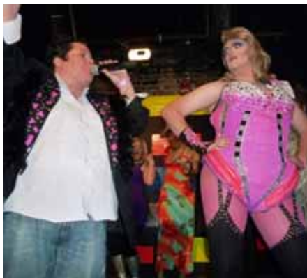
Show Bar of the Year Top 5 Finalist Club LAX