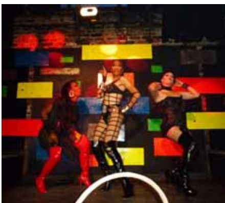
Show Bar of the Year Top 5 Finalist Oz