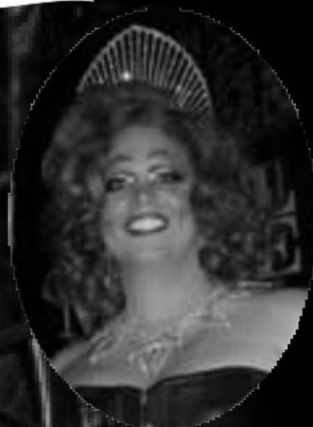
Bubbles Champagne Miss Louisiana Leatherette 2011

FOR CONTESTANT INFORMATION VISIT WWW.LORDSOFLEATHER.COM