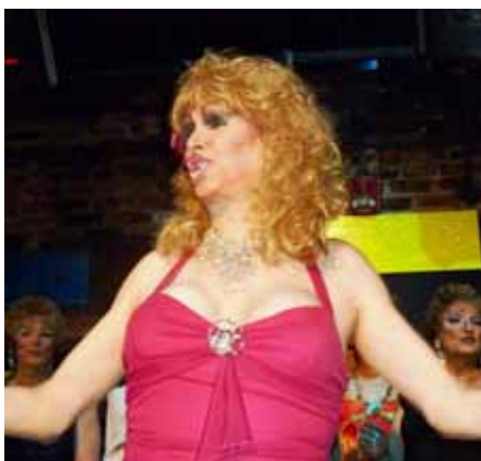
Show Bar of the Year Top 5 Finalist JohnPaul's