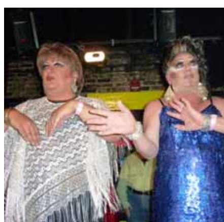
Tittie Toulouse & Electra City