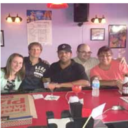
Pizza Party @ Tulane Ave Bar