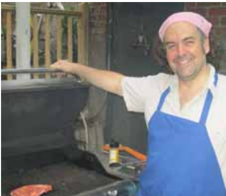
Grilling steaks for Renegade Bears Steak Night @ GrandPre's