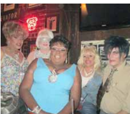
Red Carpet Celebrity Bar Crawl @ The Golden Lantern