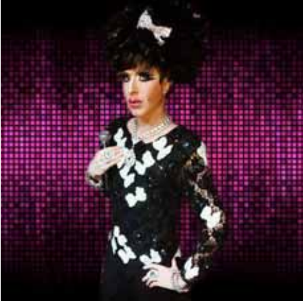
Persana Shoulders @ Oz