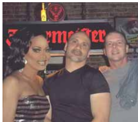
Mercedes Alexander & Company