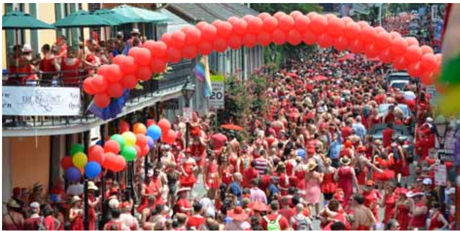
Thousands hit Bourbon Street for the 20th annual Red Dress Run spreading across the French Quarter and beyond.