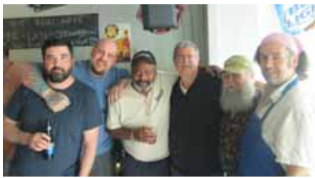
Renegade Bears of Louisiana welcome guests to Steak Night at GrandPre's in New Orleans.