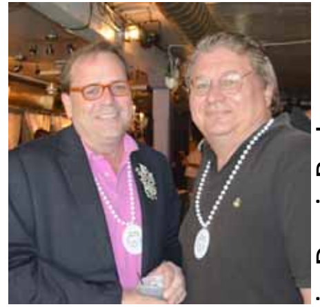
Electra City & Tittie Toulouse