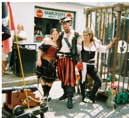
NOLA Wenches & their Pirate celebratin' outside World famous Clover Grill