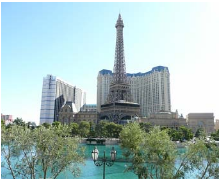
Paris Las Vegas