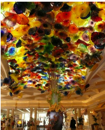
The glass ceiling in Bellagio's lobby