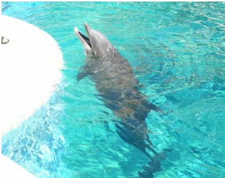
Live from the Dolphin Habitat at Siegfried & Roy's Secret Garden at the Mirage