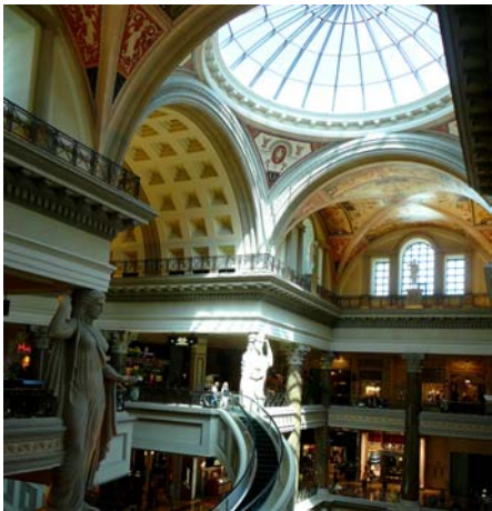
The Forum Shops at Caesars Palace