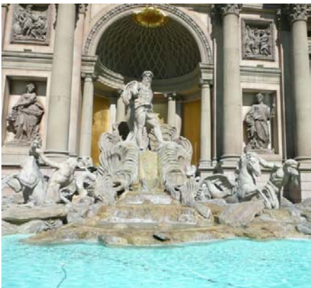
The Trevi Fountain at Caesars Palace