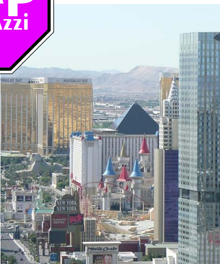
Mandalay Bay, Luxor, Excalibur