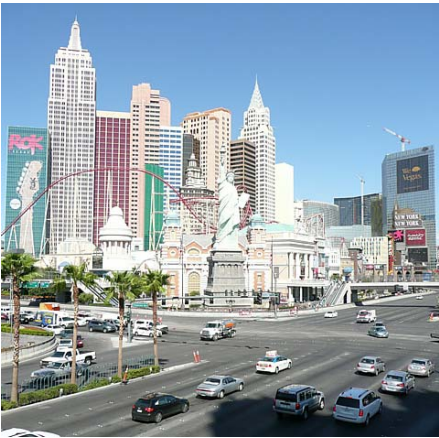
New York, New York