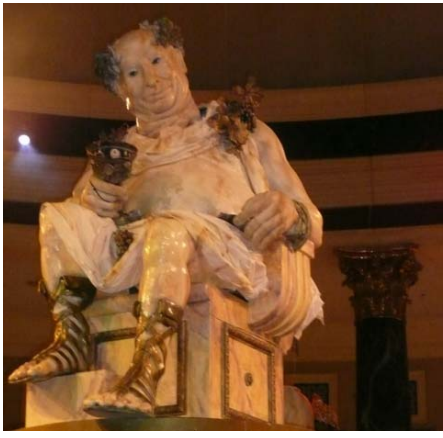
Bacchus at Caesars Palace