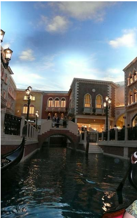
The Grand Canal at the Venetian