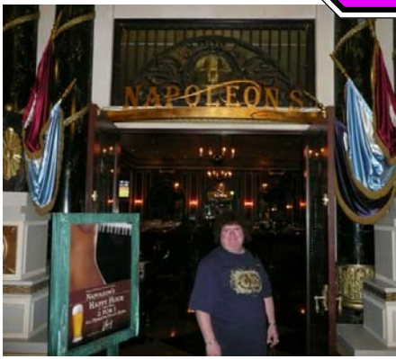
Happy Hour at Napoleon's in Paris