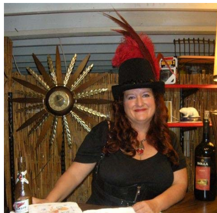
Fabulous bartender at Winky's for Art For Arts Sake