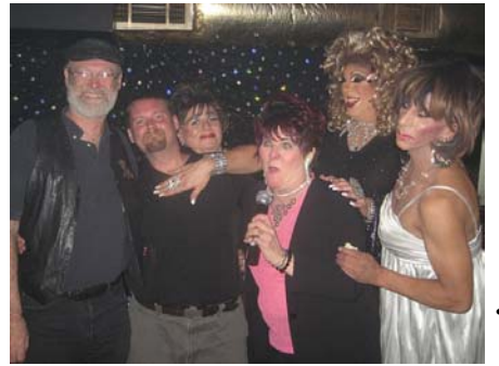
CW's Bon Voyage Show & Party was a fab send off at Starlight By The Park