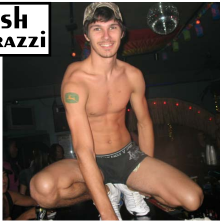
Skipper on the bar at The Corner Pocket