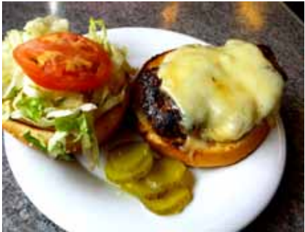
World Famous Swiss Burger @ Restaurant of The Year, Clover Grill, 900 Bourbon St.