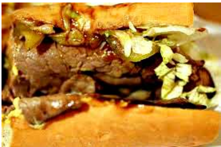
Sloppy Roast Beef Po-Boy @ Gene's Po-Boys, 1040 Elysian Fields