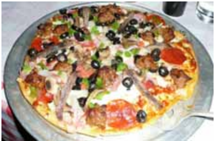
Special Combo Pizza @ Mona Lisa Restaurant, 1212 Royal St.