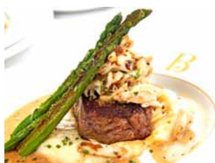
Filet Mignon Broussard @ Broussard's, 819 Rue Conti