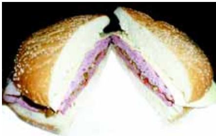
New Orleans Muffuletta @ Quartermaster: The Nellie Deli, 1100 Bourbon St.