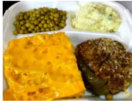
Stuffed Bell Pepper Special @ Ilys Bistro, 1040 Elysian Fields Ave.