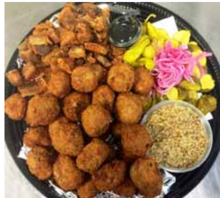
Cracklin's, Boudin Balls & Pickles @ Cheezy Cajun, 3325 St. Claude