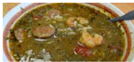
Mumbo Gumbo @ Chef Ron's Gumbo Stop, 2309 N. Causeway Blvd., Metairie