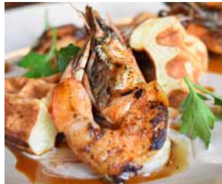
BBQ Shrimp & Waffles @ Kingfish Kitchen & Cocktails, 337 Chartres