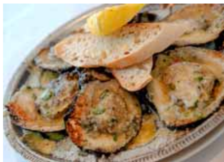
Chargrilled Oysters @ Royal House Oyster Bar, 441 Royal St.