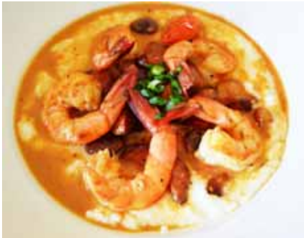
Shrimp, Andouille & Stoneground Grits @ The Country Club, 634 Louisa St.