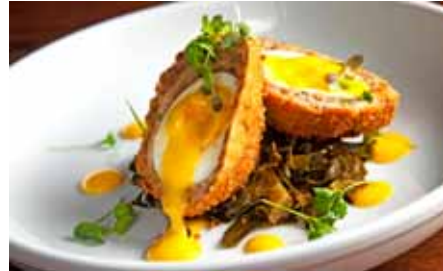
Boudin Scotch Eggs @ The Bombay Club, 830 Conti St.