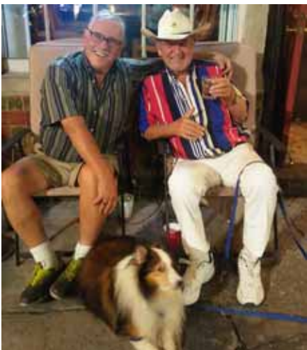
Autour de la Ville ~ New Orleans