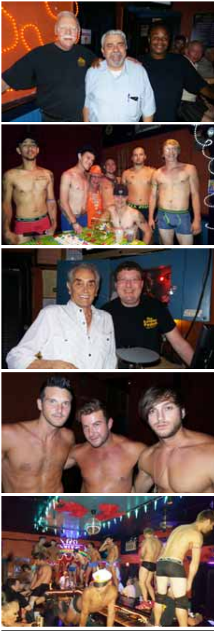
The Golden Lantern