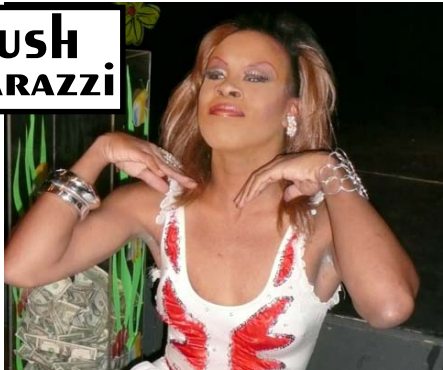
Starlight Revue's Selena