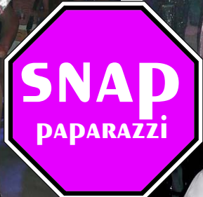
HALLOWEEN 25: The Silver Party benefiting Project Lazarus ~ New Orleans ~ Photos by Rip Naquin-Delain