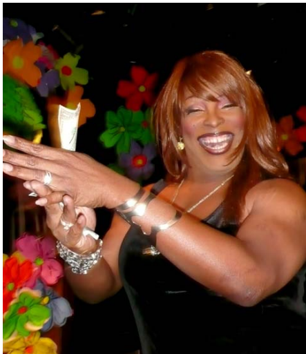
Zoo Revue's Bliss