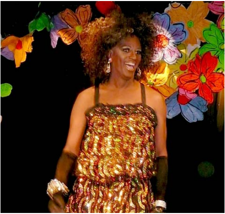
Fish organized the fab fund-raiser