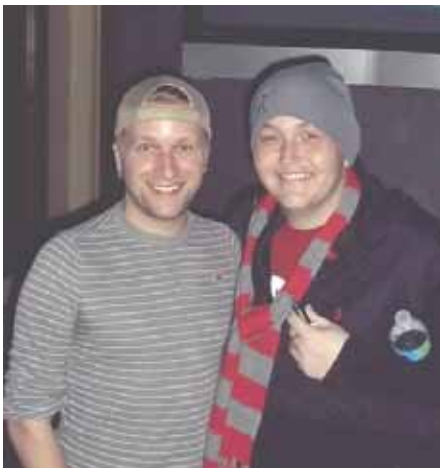
Sending light & love to Parker