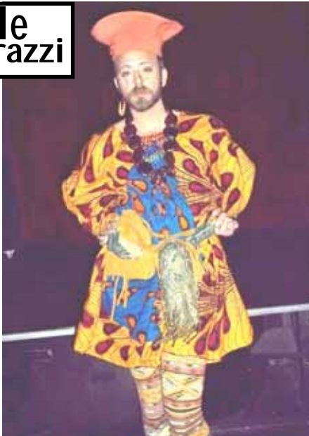
Tribal Judson returning from Africa