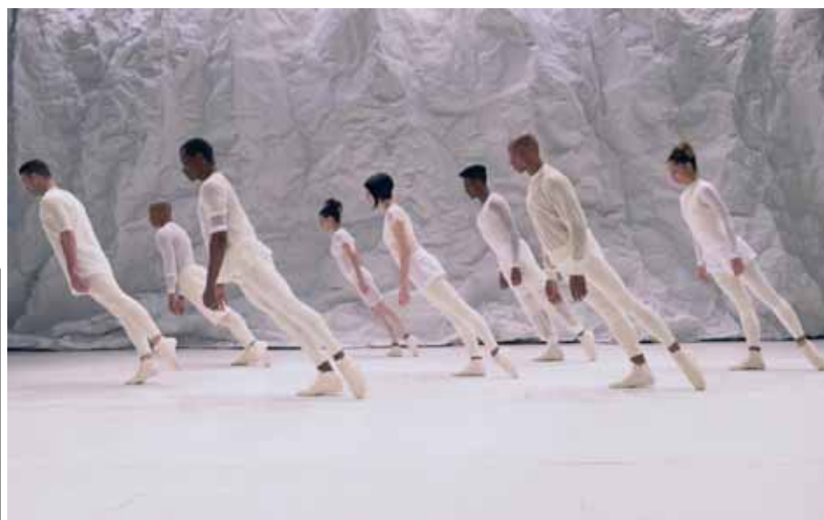
Grupo Corpo in Suíte Branca

The Bernie people preached all along that we need a revolution. And they are right about that. But they err when they assign blame for Trump's victory to a particular candidate or party. The problem is much more complicated than that. Notwithstanding the 204 million Americans who didn't bother to vote, the real blame falls on the failure of our nation's leaders to adequately adapt to the new global economy. Surges in nationalism around the world such as the Brexit vote in England and Trump's victory here are symptoms of a larger problem, namely the need to minimize the economic inequality caused by the concentration of wealth. The real issue is globalism, an inevitable phenomenon that poses