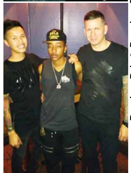
Bourbon Pub & Parade

NEXT DEADLINE: Tues., Nov. 29 504.522.8049 ripna@ambushmag.com