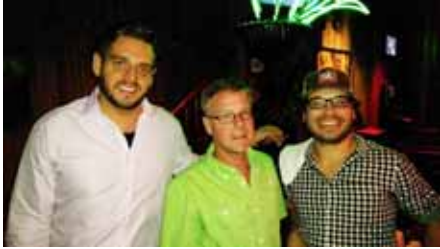
Good Friends Bar