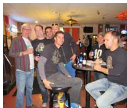
The Phoenix, Lords of Leather