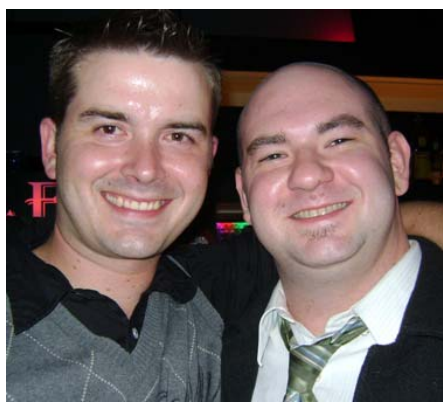
Now that's some true divas for you all @ Jules Downtown