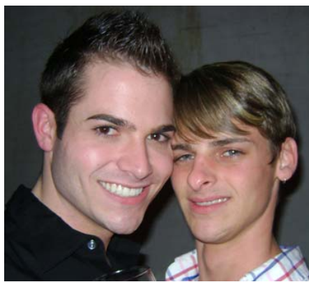
And these two were just adorable @ Jules Downtown