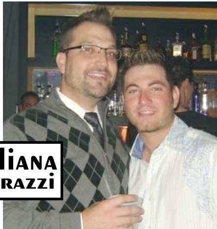
These two at it again for the best Ambush pic @ Jules Downtown