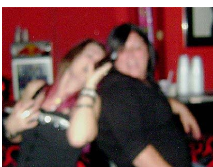
And now for the crowd around her @ Sound Factory