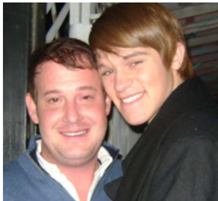
Hunter & his hot little man @ Jules Downtown