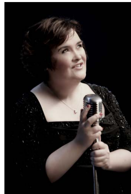
Susan Boyle