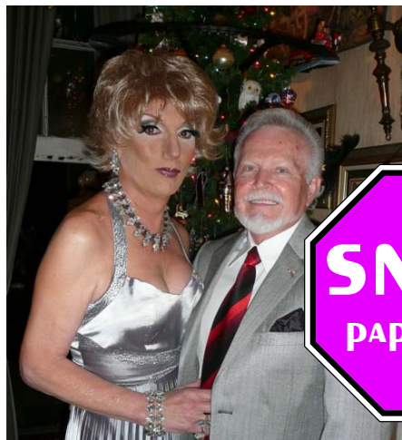
Silver Sponsors EGM VII & KCQ XVII-Elect Opal Masters & Darwin Reed