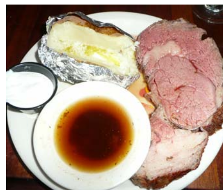
Prime Rib with baked potato Sunday evenings at Bywater Restaurant, Deli & BBQ, 3162 Dauphine St.