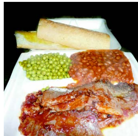
BBQ Brisket with two sides at Restaurant/Deli of the Year Quartermaster: The Nellie Deli, 1100 Bourbon St.