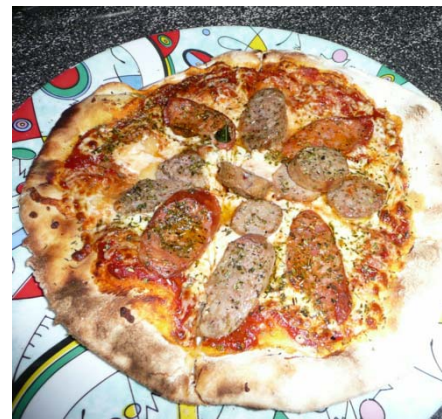
Gourmet Pizza (Salsiccia Marinara) at Louisiana Pizza Kitchen, 95 French Market Place