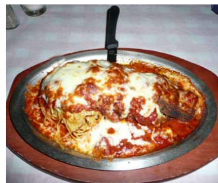
Eggplant Parmesan at Mona Lisa Restaurant, 1212 Royal St.