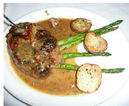
Osso Buco at Maximo's Italian Grill, 1117 Decatur St.