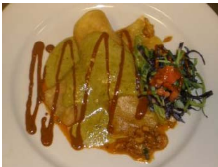
Crawfish Enchiladas (Crawfish & Bayou Crab rolled in a corn tortilla with Melted Monterey Jack & Roasted Poblano Salsa) at Tomatillo's, 437 Esplanade

Louisiana Pizza Kitchen , 95 French Market Place is famous for its wood fired gourmet pizzas, pastas, salads and appetizers. Open 7 days from 11am-10pm, call 522.9500 or visit LouisianaPizzaKitchen.COM .