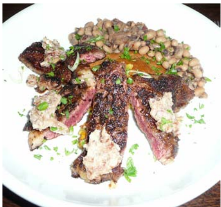
Blackened Ribeye at The Country Club, 634 Louisa St.

Krystal , 116 Bourbon at Canal, Open 24 hours, it's one of the best stops for fast food with tasty burgers, hot dogs and breakfast. Call 523.4030 for more info.