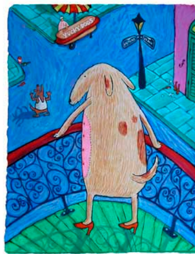
'A Street Dog Named Desire' BARKUS 2007

The 2007 Krewe of Barkus Parade starts at Armstrong Park on Sun., Feb. 11 promptly at 2pm and proceeds on its traditional 15-block route through the Vieux Carré, stopping at the VIP Reviewing Stand at Good Friends Bar, corner Dauphine and St. Ann, where VIPs (and those who desire to be VIPs) will toast the Roval Court.