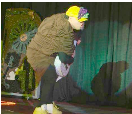
Biscuit - Raisinets