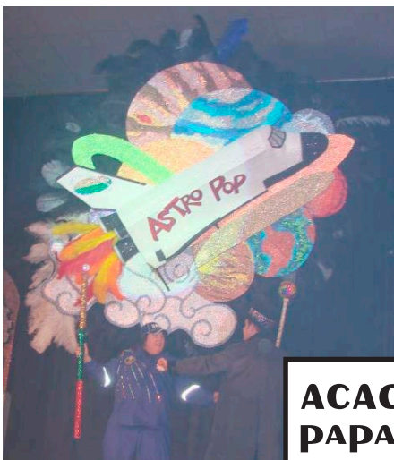
Angie Clause - Astro Pop