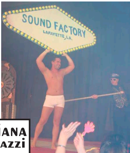
Sound Factory - Lollipops