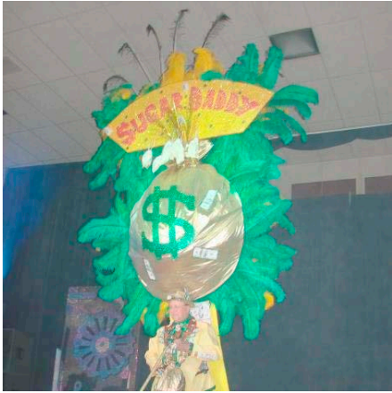
Clyde Schroeder III - Sugar Daddy