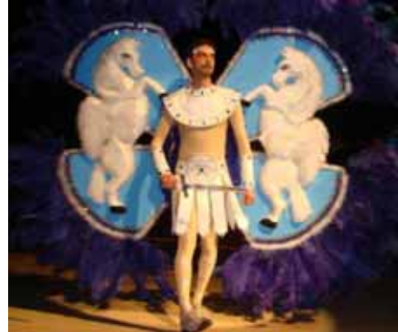
Mythic Venom: Persius