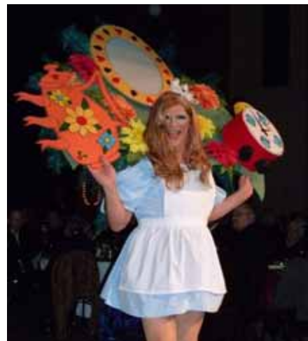
Legends of Literature: Alice in Wonderland