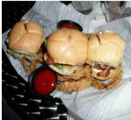
Gourmet Sliders with Onion Rings @ 700 Club Restaurant, 700 Burgundy