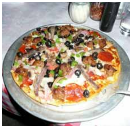
Special Combo Pizza (pepperoni, Italian sausage, ham, onions, mushrooms, green peppers & black olives with jalapenos & anchovies optional) @ Mona Lisa Restaurant, 1212 Royal St.