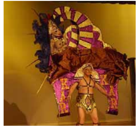
Mythic Riddler: Sphinx