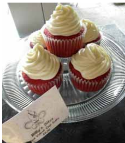
Red Velvet Cupcakes @ Who Dat Coffee Cafe, 2401 Burgundy St.