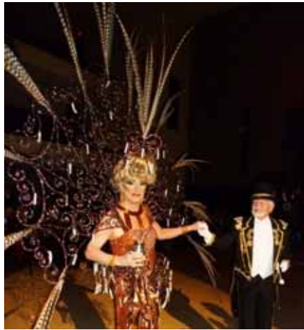
Legends of Fashion: Bob Mackie