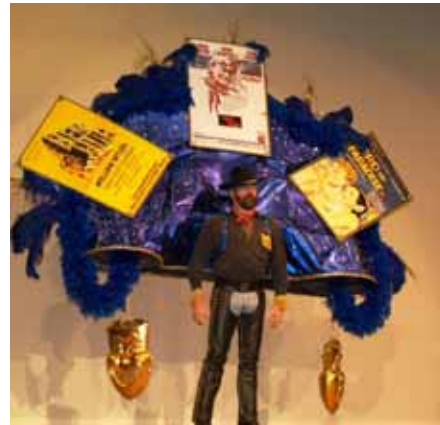
Legends of Stage & Screen: John Wayne