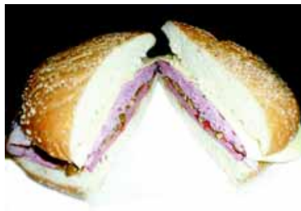
New Orleans Muffuletta (generous helping of ham, salami, provolone and olive salad) @ Restaurant/Deli of the Year Quartermaster: The Nellie Deli, 1100 Bourbon St.