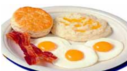
Custom Breakfast @ Krystal, Bourbon St. @ Canal