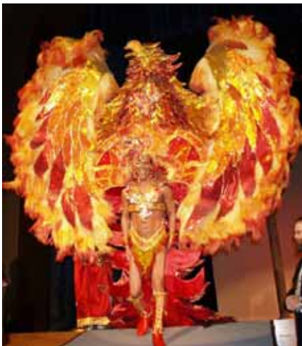
Ball Lt., Mythic Rebirth: Phoenix