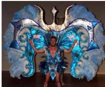
Mythic Waters: Poseidon