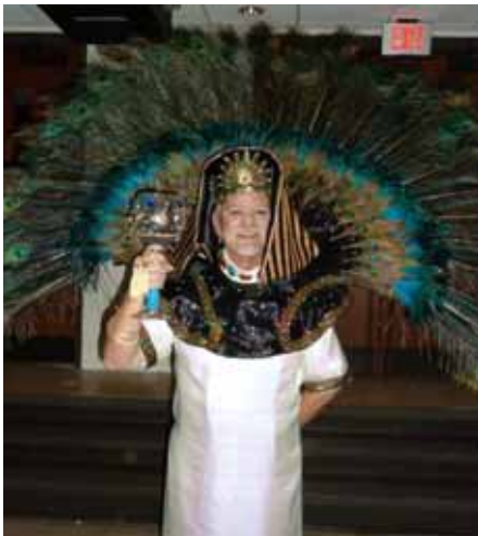
Captain: Mythic Deity: Amon-Ra