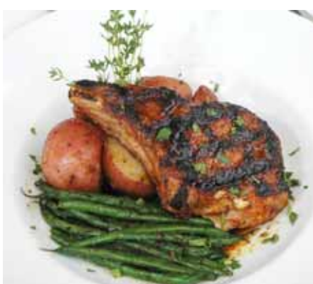
Glazed 10 oz. Pork Chop with Steen's Cane Syrup & Creole Mustard served with duck fat potatoes & green beans @ The Country Club, 634 Louisa St.