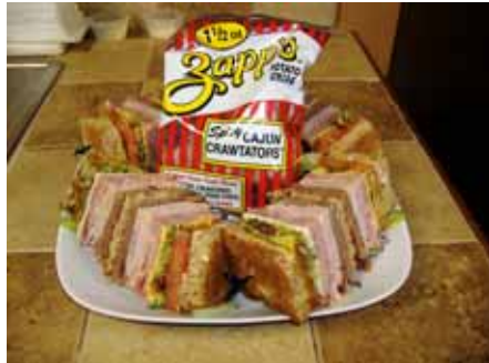
Club Sandwich with Zapp's Potato Chips @ The Decadence Shoppe, 806 N. Rampart St.