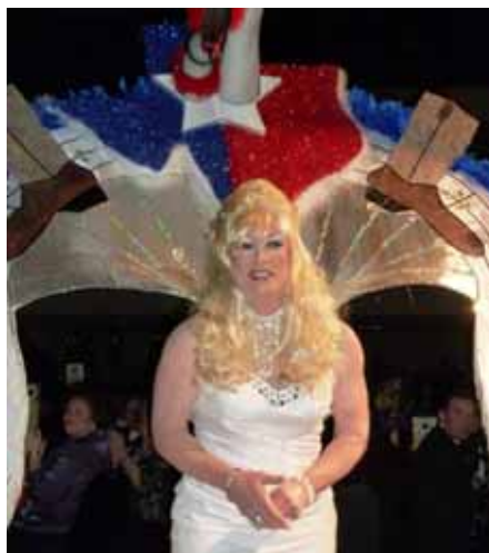
Legends of Music: Dolly Parton