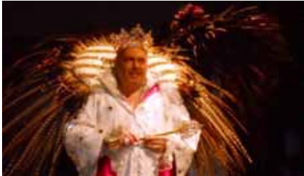
King Amon-Ra XLV, Legends of Love: Romeo