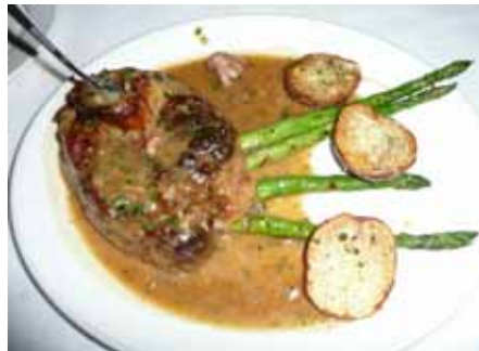
Occo Buco , braised veal shank in a garlic, thyme and white wine demi with asparagus & potatoes @ Maximo's Italian Grill, 1117 Decatur St.