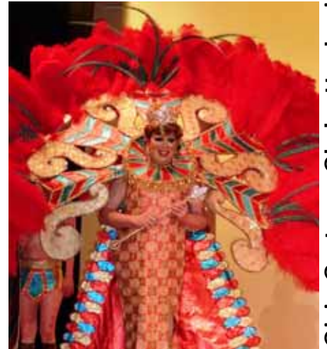
Queen Amon-Ra XLVI, Legends of History: Cleopatra