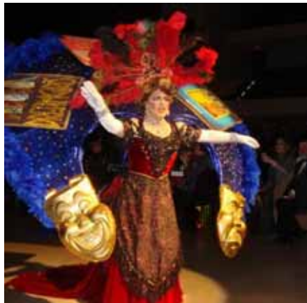
Legends of Stage & Screen: Carol Channing