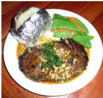
12 oz. Blackened Ribeye @ Bywater Restaurant, Deli & BBQ, 3162 Dauphine St.