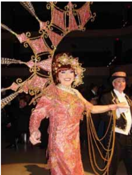
Legends of Fashion: Erte'