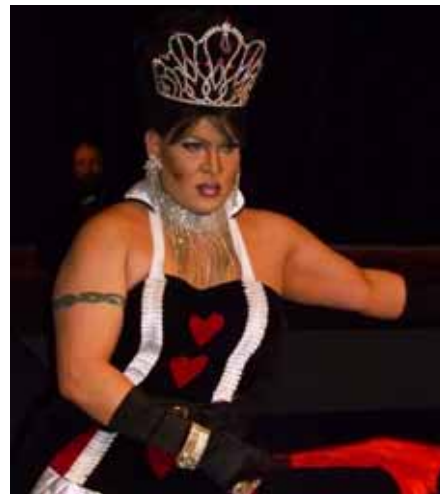
Legends of Literature: Queen of Hearts