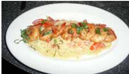
Garlic Shrimp Pasta (jumbo shrimp with garlic butter sauce over angel hair pasta) @ Louisiana Pizza Kitchen, 95 French Market Place