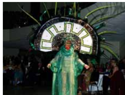
Mythic Venom: Medusa