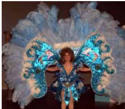
Mythic Waters: Amphitrite