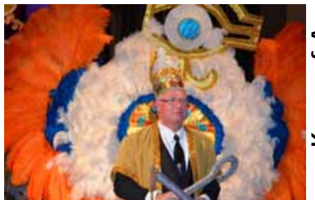
Krewe of Amon-Ra Mardi Gras Ball XLIX: A Year Through The Eye of Amon-Ra @ Sigur Civic Center ~ Chalmette, LA ~