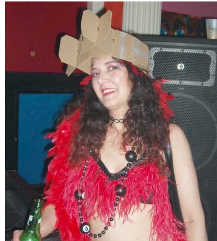
Crack Whore Queen VIII Wendy

Tickets are limited to 250 and are going fast.