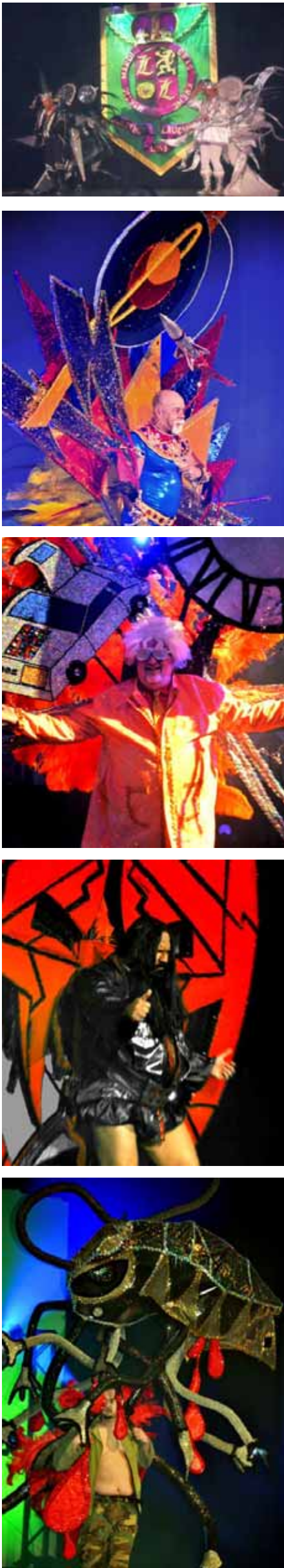
Lords of Leather Bal Masque XXIX: The Sci-Fi Ball @ Frederick J. Sigur Civic Center ~ New Orleans ~ Photos by AL Dwain, Grey Cross