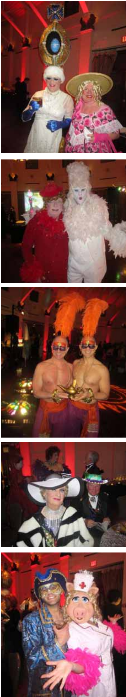
Friday Night Before Mardi Gras Extravaganza XIII: Immortals Ball @ Audubon Tea Room ~ New Orleans