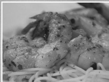
GARLIC SHRIMP ON ANGLE HAIR PASTA