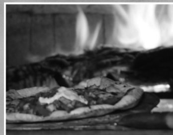
AUTHENTIC WOOD FIRED PIZZA