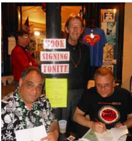
Mardi Gras Highlights ~ Metairie, New Orleans ~