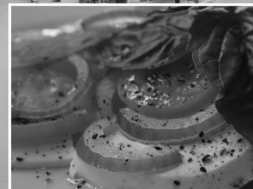
FRESH WATER MOZZARELLA SALAD