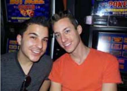
In for Zingo @ The Corner Pocket