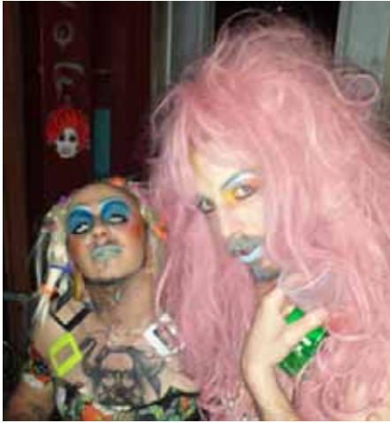
16th Crack Whore Ball