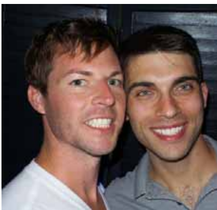
Zingo @ The Corner Pocket