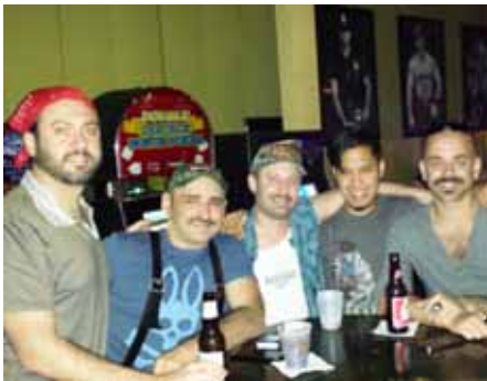
Rawhide bartenders relax for after weekend cocktails @ Phoenix