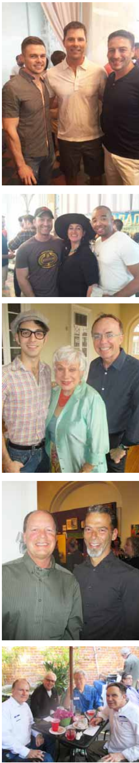
The Social Scene ~ New Orleans